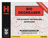
BIODEGRADABLE HYDRAULINK BIO DEGREASER Page 24-1